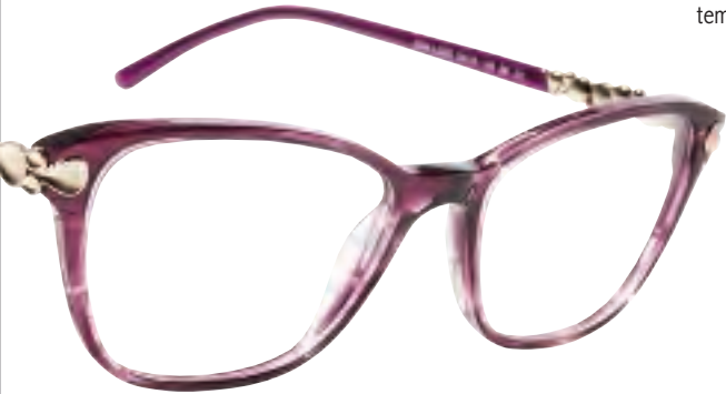
Prodesign , model 5644, colour 3535, features jewellery-like detailing on the side of the frame