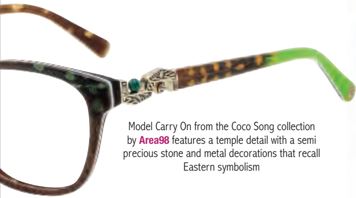
Model Carry On from the Coco Song collection by Area98 features a temple detail with a semi precious stone and metal decorations that recall Eastern symbolism