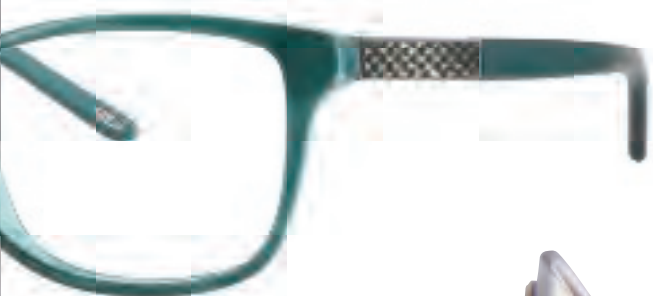
Model Cocoa Mint 9040 from Eyespace is embellished with luxury leather and chic metallic accents to give a unique, vintage influenced feel to the frame