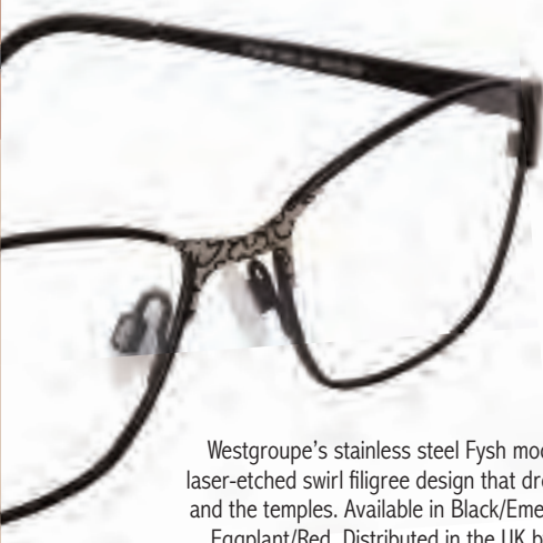
Westgroupe's stainless steel Fysh model F-3567 features a delicate laser-etched swirl filigree design that dresses the bridge, the end-pieces and the temples. Available in Black/Emerald, Ink/Purple, Black/Gold and Eggplant/Red. Distributed in the UK by Ridgeway Optical Supplies