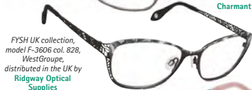
FYSH UK collection, model F-3606 col. 828, WestGruppe, distributed in the UK by Ridgway Optical Supplies