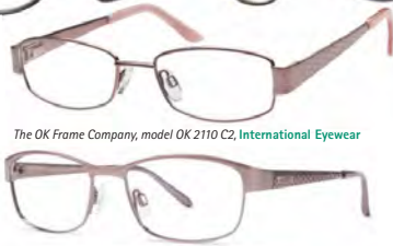
The OK Frame Company, model OK 2110 C2, International Eyewear