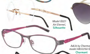
Model G021 Art Eternel, Silhouette