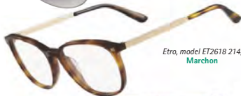
Etro, model ET2618 214, Marchon