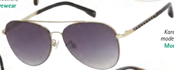
Karen Millen, model KM7006, Mondottica