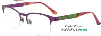
Kaos collection, model KK425, Area98