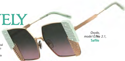
Oxydo, model O.No 2.1, Safilo

These looks work hard for opticians. Pared down decorative elements can be unisex, especially with styles that trace and embed lines round frames. And there is further versatility as these styles also work for both ophthalmic and sunglasses, as can be seen with models from Safilo, Mondottica and Mykita. With their references to jewellery and often-classic proportions, these frames have a broad appeal that just doesn't date. For those looking for investment styles that will last the test of time, look no further. ♦